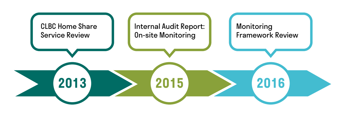
EXHIBIT 5: Timeline of monitoring framework evaluations