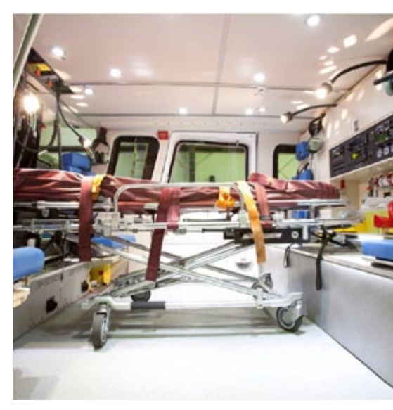
The inside of an air ambulance helicopter.

BCAS has developed specific performance measures for air ambulance service and the CCT Program continues to improve the reporting system. This section of the response will outline what work has been done to date and what will be done in the future to establish, measure and report performance standards.